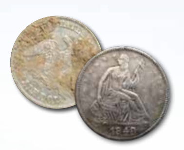
"I brushed some of the dirt away and I saw it an 1848 Silver Seated Half." - Mike